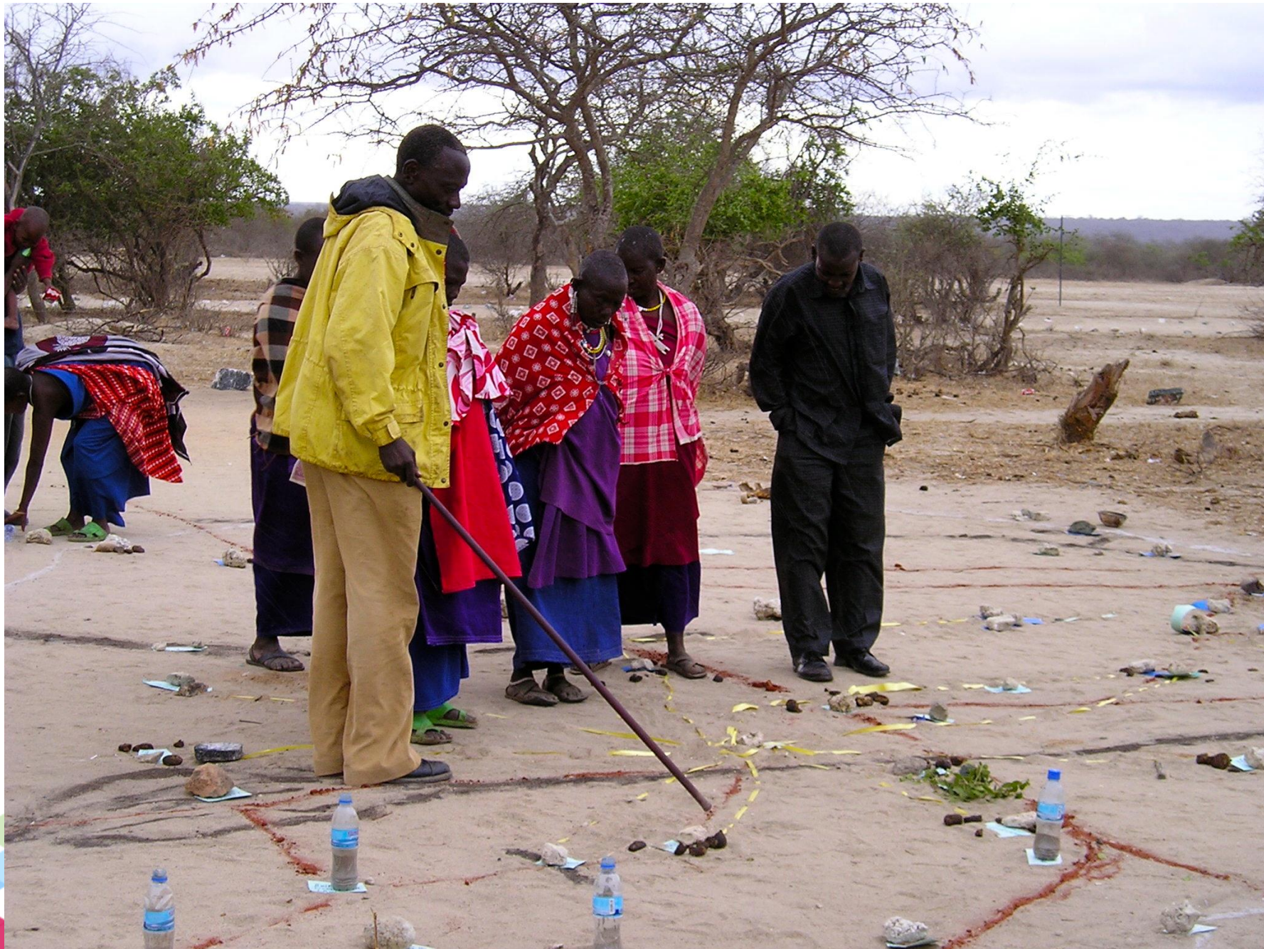
Panama 20-25 June 2016