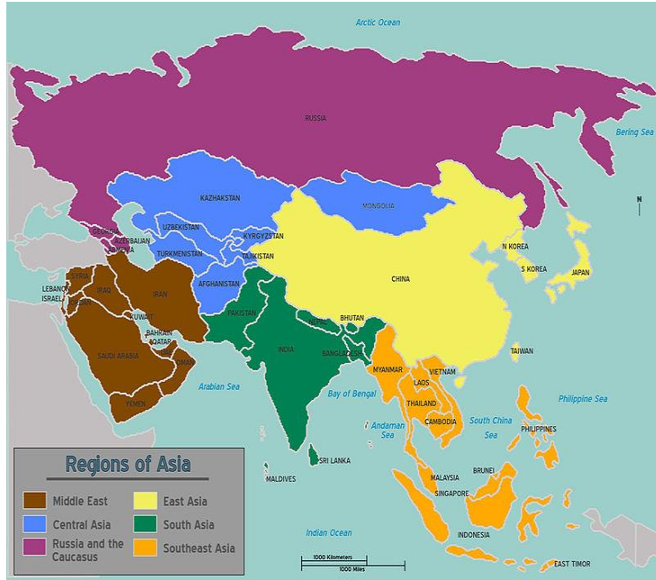
MAP of CENTRAL ASIA