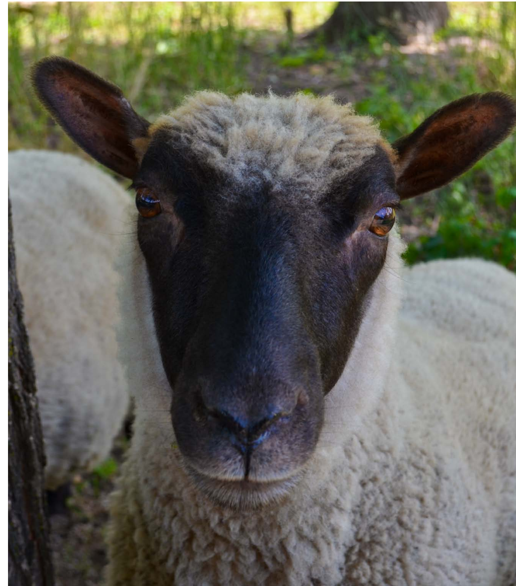
Clun Forest ewe